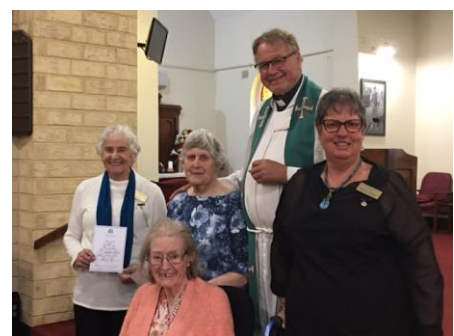
Mandurah members receiving their awards